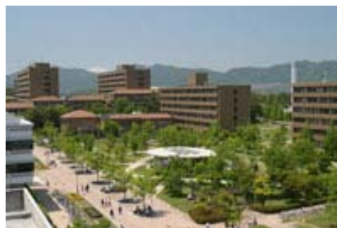
Figure 2: Hiroshima University

Because the extended abstracts will be distributed as a USB memory, we recommend to use colored figures as shown in Fig. 2.